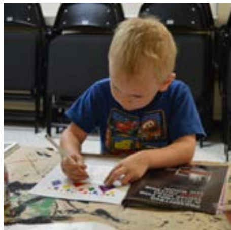
Art Camp 2016 participants flexing their creative muscles bringing Biblical stories to new life through various art medium.