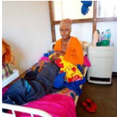
AFTER: New beds, mattresses, and bed side stands fill the newly painted OB ward, making a hospital stay dignified and comfortable for new moms.