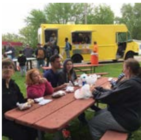
Open Table serves new guests every Thursday evening.