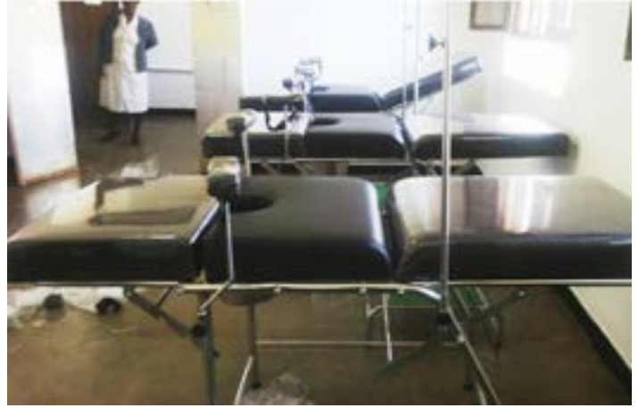
AFTER: Three new delivery beds were purchased as a part of Zumbro's Helping Iambi Deliver campaign. Thank you!