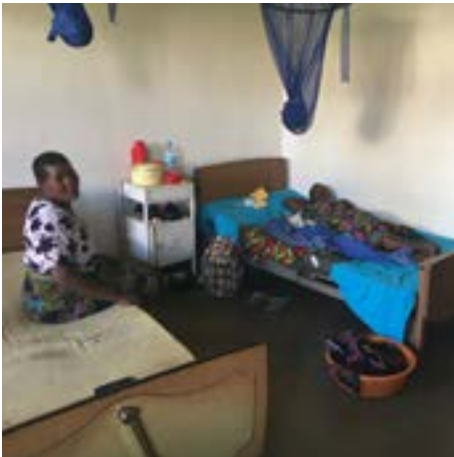
BEFORE: A new mom and grandma sit on old, run-down mattresses.